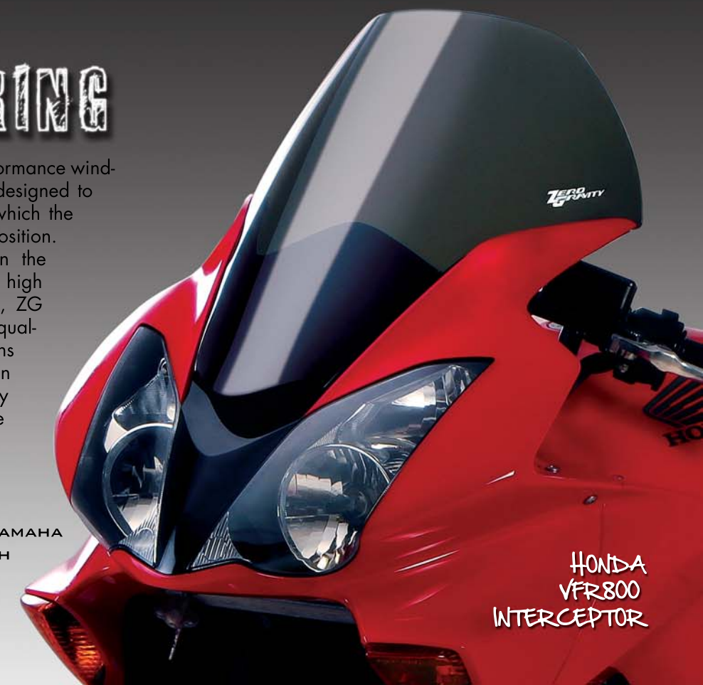
HONDA VFR800 INTERCEPTOR