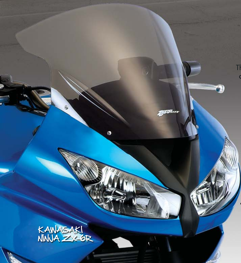
KAWASAKI NINJA ZX-6R